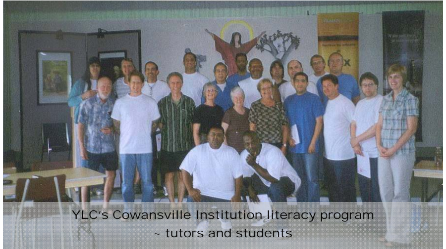
YLC's Cowansville Institution literacy program ~ tutors and students